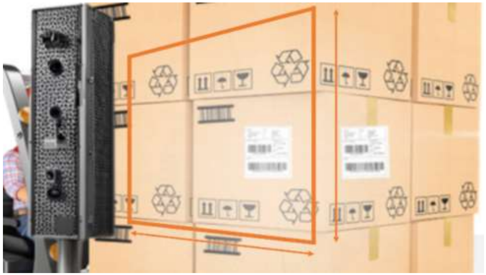
Scanning area depends on the camera and lens FOV

When selecting cameras and lenses for these applications, care still needs to be taken to understand the number of pixels that will be available per X-dimension or module of the barcode.