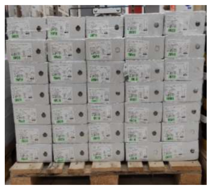
Scanning all the codes on a pallet in Milliseconds

Speed of scanning is also important. The need for resolution (discussed above) means that image file sizes are usually large (with 20MP cameras for instance). Each image therefore needs to be processed in milliseconds by the Viziotix decoder so that the scanning image rate can be as high as possible to allow for fast moving trucks and the most efficient final operation.